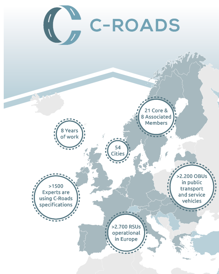
Figure 1: Overview of C-Roads coverage